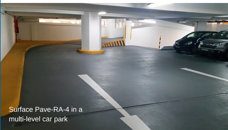
Surface Pave-RA-4 in a multi-level car park