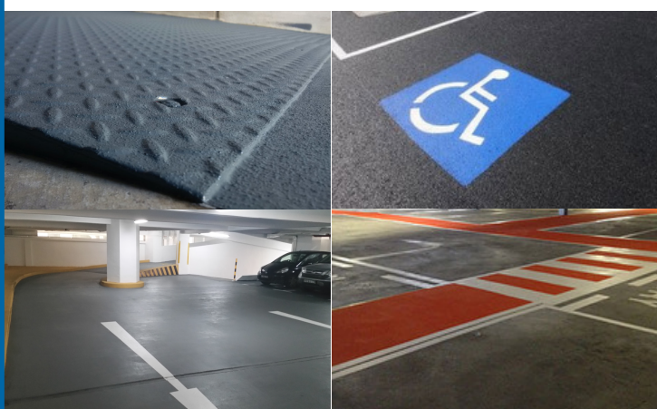
Typical applications for Surface Pave-RA-4